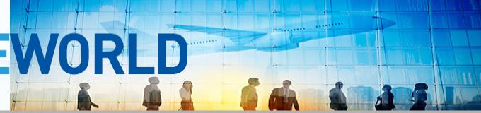
World passenger traffic evolution 1945 – 2022